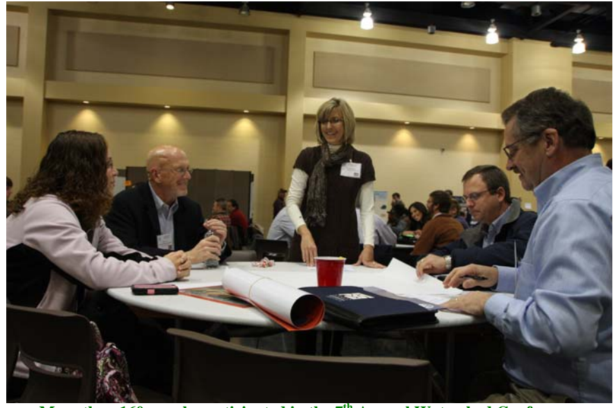
More than 160 people participated in the 7<sup>th</sup> Annual Watershed Conference

On December 7, 2011, ADEM staff participated in the 7<sup>th</sup> Annual Watershed Conference sponsored by the Alabama Clean Water Partnership. The event took place at the Clanton Conference and Performing Arts Center at Jefferson State Junior College, with the theme "Learning from the Past - Planning for the Future." With various groups, organizations, and state agencies being asked to "do more with less," the one-day conference provided 162 participants with an opportunity to hear and present strategies to promote healthy watersheds and improve water quality in Alabama. The event was designed to help the collaboration efforts between various groups with specific water