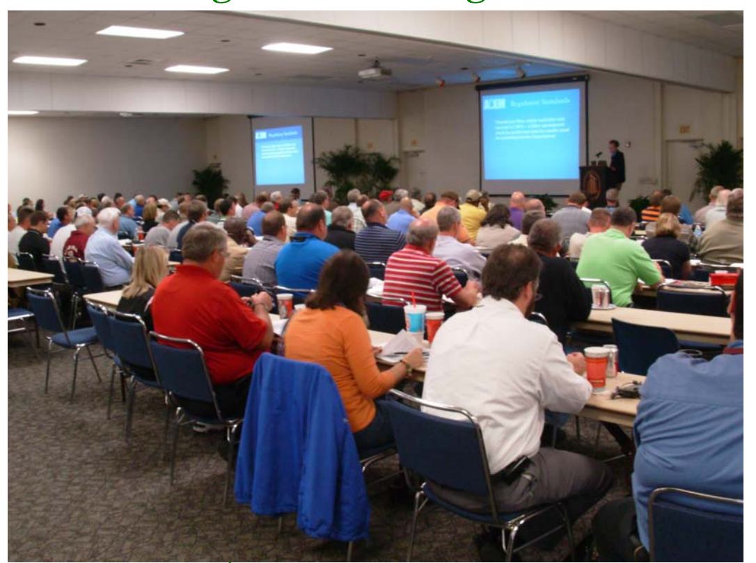
ADEM held its 14th Annual Surface Water Meeting on October 17-18 at AUM

Approximately 250 public water system operators, engineers, and consultants recently conferred to discuss drinking water treatment, safety, operator certification, and security at the 14<sup>th</sup> Annual ADEM Surface Water Meeting.