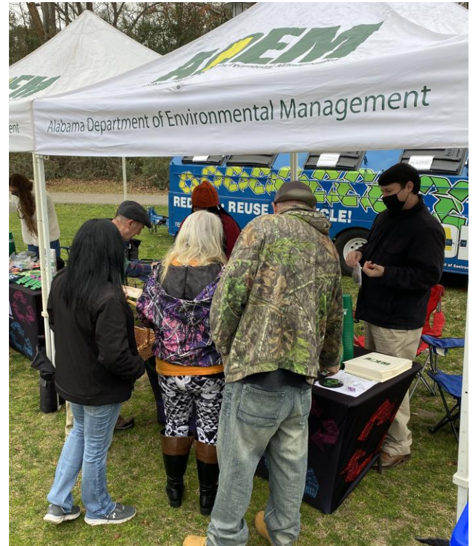
ADEM's recycling outreach in Millbrook was a big success

Alabama's recycling fund grants promote local efforts in recycling by providing reimbursement grants to local governments to develop, implement, and enhance recycling programs, including the recycling of aluminum, paper, plastic, cardboard, and glass. Proposed recycling projects must be consistent with the approved local Solid Waste Management Plan (SWMP), and the funding can also be used for any revisions to the existing SWMP.