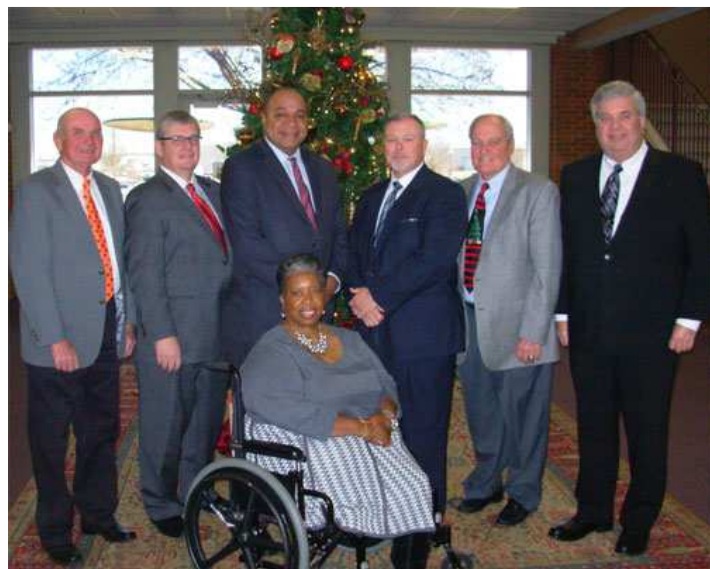
The full commission prior to the December 12<sup>th</sup> meeting

The Alabama Environmental Management Commission met on December 12, and dealt with seven items on the agenda, and heard one presentation during the meeting's public comment period.