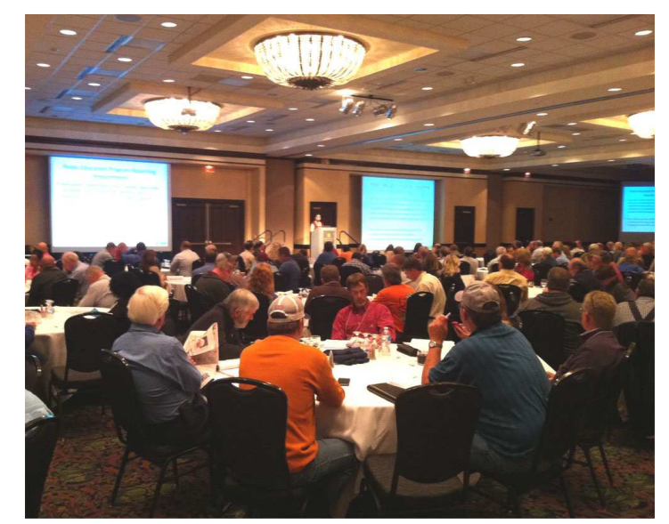
A record 347 people attended the Annual Surface Water Meeting

An update on ADEM's Area Wide Optimization Program and AWOP awards were also presented at the meeting. AWOP is a voluntary program designed to help surface water treatment plants perform at peak efficiency and exceed federal drinking water standards for health and safety. The optimization process helps drinking water systems maximize public health protection against a broad range of risks from waterborne contaminants.