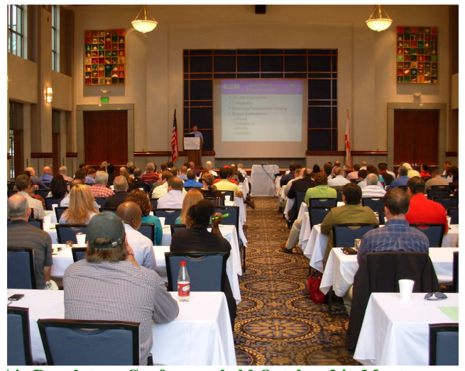
Air Regulatory Conference held October 3 in Montgomery

In October, ADEM hosted more than 250 industry representatives and environmental consultants at the Alabama Air Regulatory Update, held at the RSA Activity Center in Downtown Montgomery.