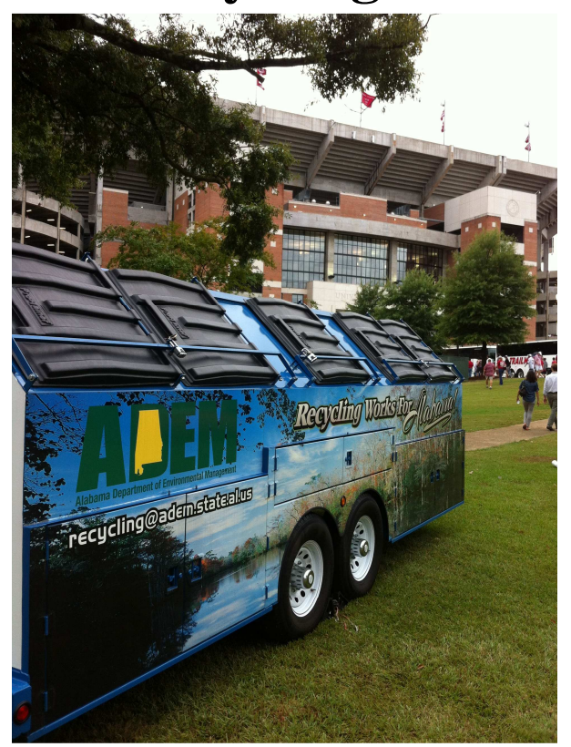
Recycling Trailer outside Bryant-Denny Stadium

The Alabama Crimson Tide and the Auburn Tigers each had highly successful football seasons in 2013, and ADEM's Recycling Trailers have spent a lot of time outside both home stadiums.