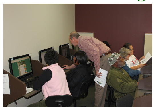
Residents in Uniontown attended a website training event on February 25

In February, ADEM provided an opportunity for the residents of Uniontown to receive training on how to access environmental information from the Department's website. The event focused on the Department's new electronic complaint system (e-Complaint), the electronic filing system (e-File), and the What's Happening in Your County feature.