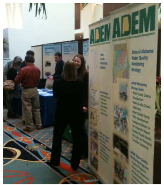
More than 280 attended the NPS Conference

The Alabama Department of Environmental Management held its 25<sup>th</sup> Annual Nonpoint Source Conference in January at the Renaissance Hotel in downtown Montgomery. The event was attended by more than 280 environmental engineers, biologists, geologists, municipal leaders, and water quality specialists.