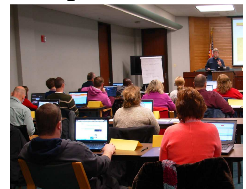
More than 40 people attended the RCRA training hosted by ADEM

The training was originally scheduled for three days, but was cut short by the inclement weather and travel conditions in Alabama on January 29-30. However, during the one day of training a number of subjects were covered including an overview of financial assurance for RCRA hazardous waste facilities. More than 40 participants learned about closure and post-closure financial assurance, third party liability, and corrective action. Subtitle C of the Resource Conservation and Recovery Act establishes financial assurance requirements for owners