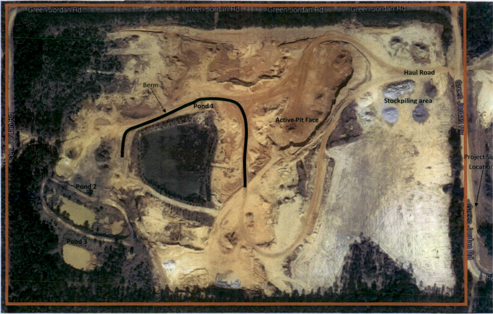
Baldwin County Red Hill Pit 2014 Photography