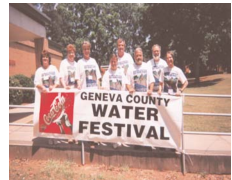
The Geneva County Festival Planning Team

For an event of this magnitude to be successful, the assistance of many dedicated individuals is needed. Festival volunteers are called upon to lead, as well as serve in many different capacities. A volunteer base of 45 to 100 is vital to a smoothly run event. The planning team, activity presenters and tour guides are all volunteers that represent a cross-section of organizations and people across the county. Additional volunteer jobs include transportation logistics, organizing and distributing teacher resource materials, feeding the volunteers, publicity, as well as sorting and distributing activity materials to the presenters. The planning team will meet monthly for approximately 9 months to plan for and organize the event. The team is responsible for contacting schools and sponsors, sending out educational materials to teachers, choosing activities, conducting a student T-shirt design contest, reserving entertainers and securing a host facility. Funds for the event are raised through local sponsorship.