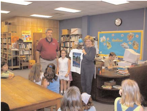
Presenting the award to the Geneva County Groundwater Festival T-shirt design contest winner and her teacher