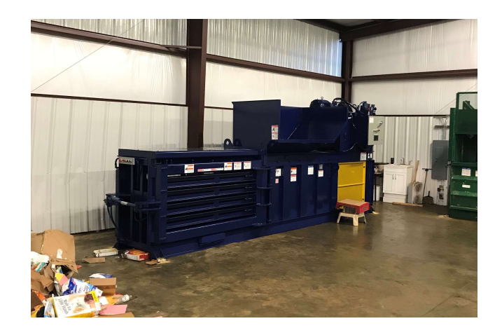
Grants allow for the purchasing of necessary infrastructures that aid in efforts for transporting recyclables.