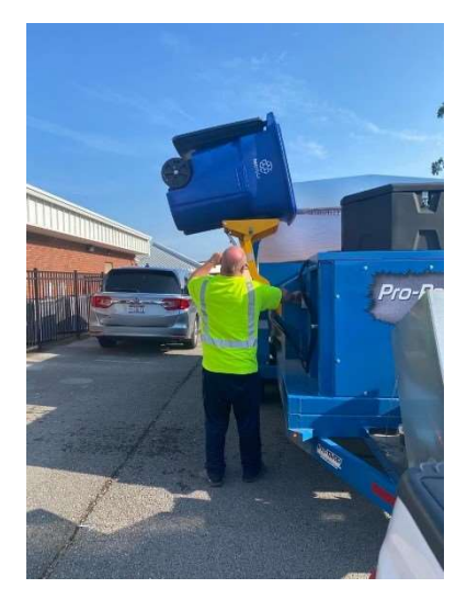
Equipment for sorting and processing is also eligible under the program.