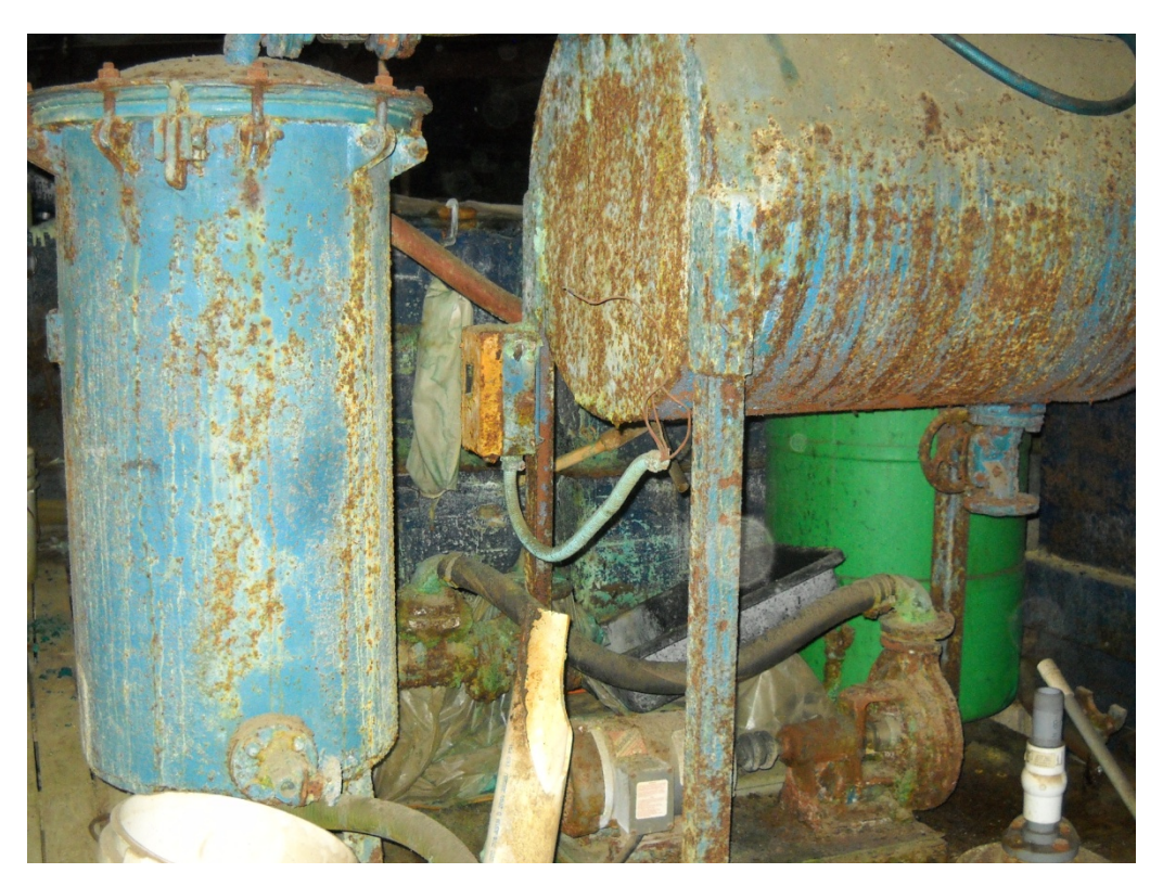
Transformer and equipment, A-1 Plating