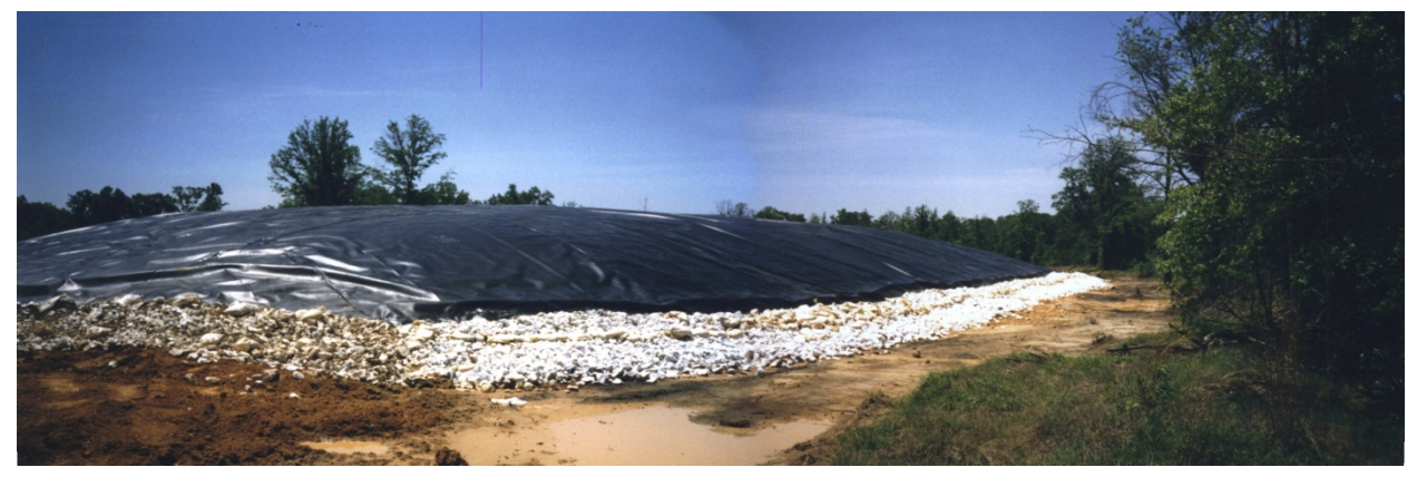
Brass foundry waste staged for removal