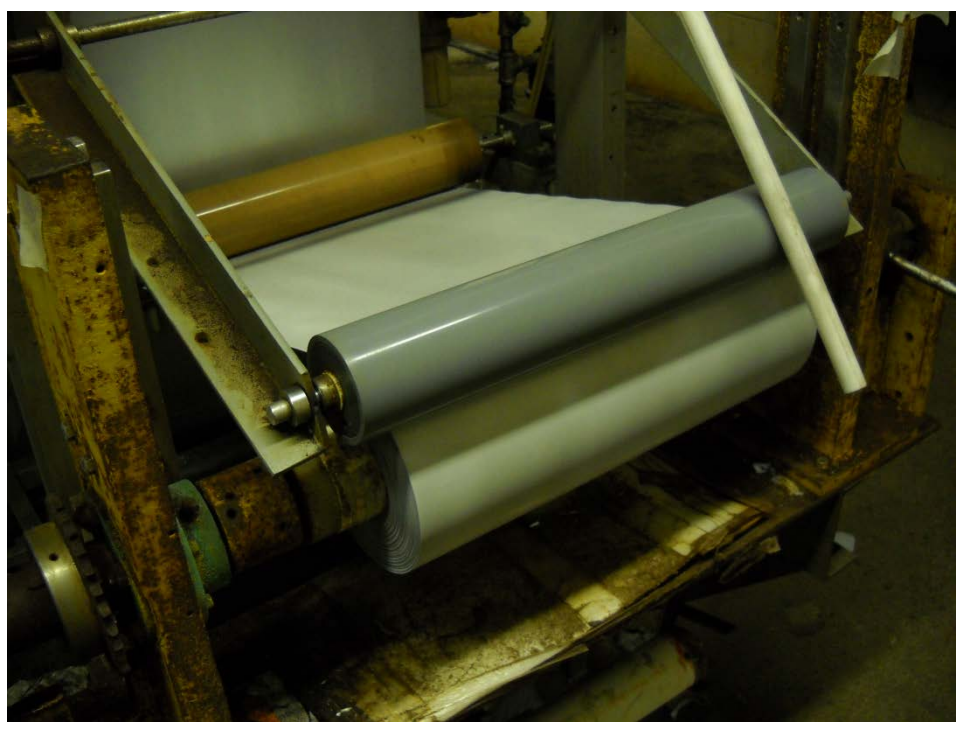
Aluminum foil rolls in etching machine