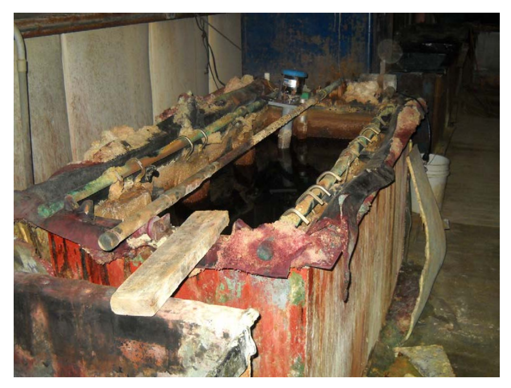
Liquids in Plating Vats, A-1 Plating, Tuscumbia, AL