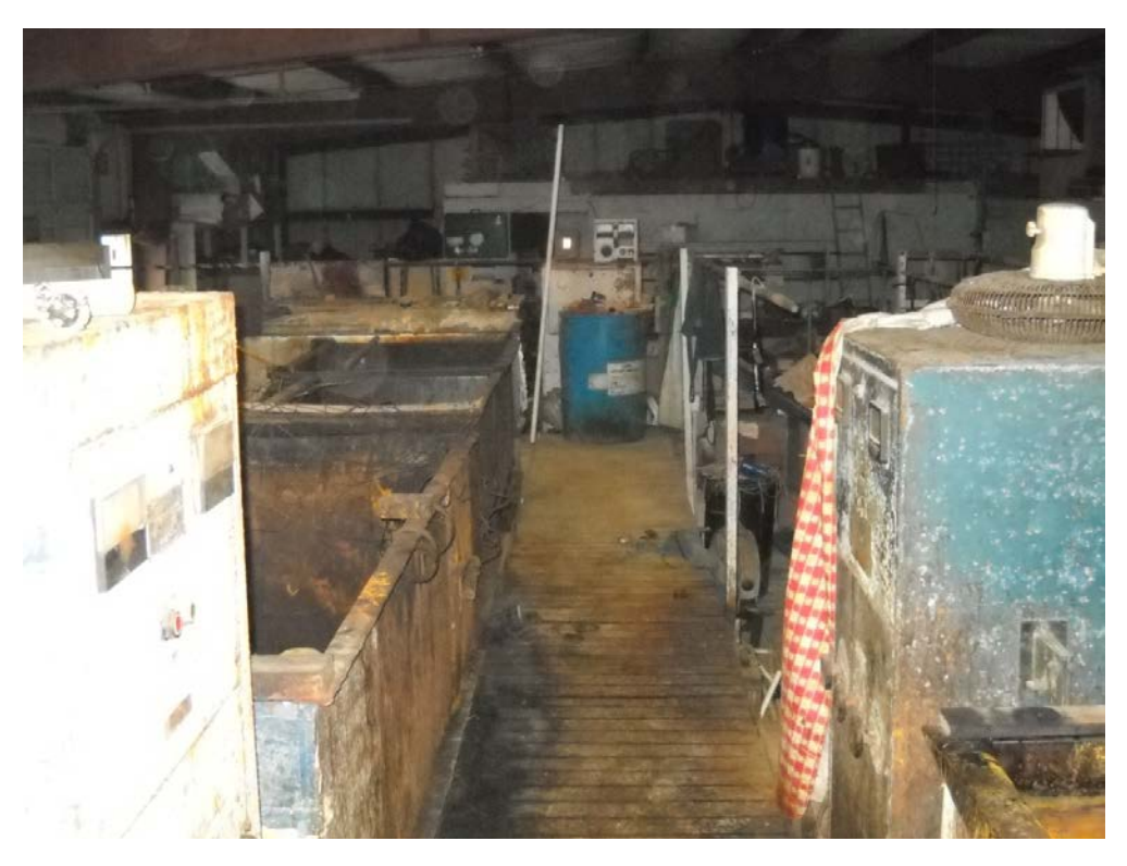
Plating Line Vats at A-1 Plating, Tuscumbia, AL

around the building. Those results will indicate whether further action will be required at the Site under the AHSCF.