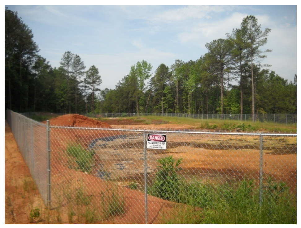
Completed slurry containment wall and enclosure

EPA constructing a slurry containment wall around the lagoons