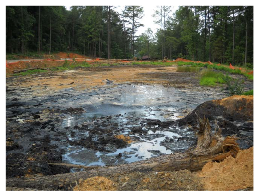
Main lagoon containing tar and asphalt-related waste