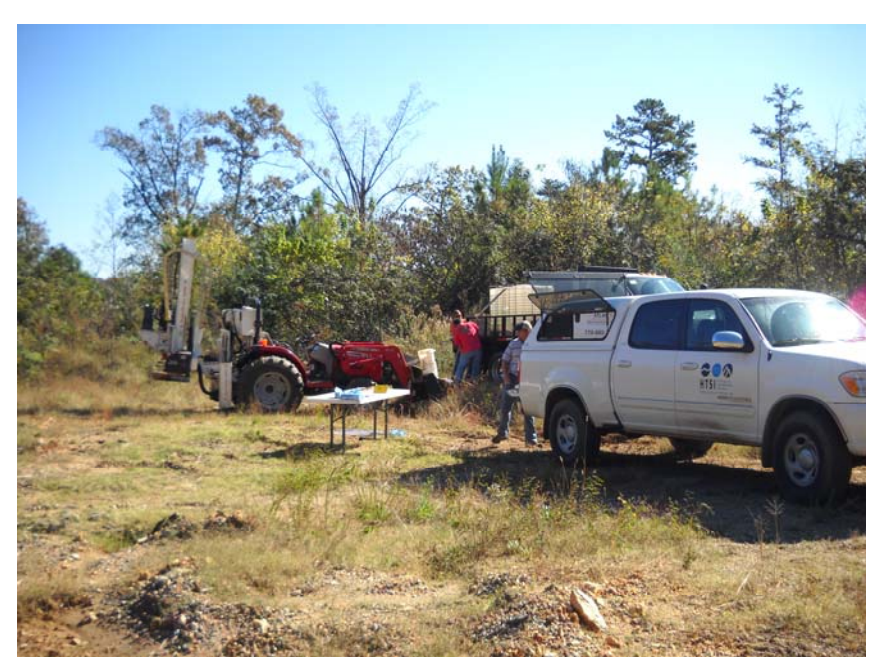
Environmental contractors collecting groundwater samples