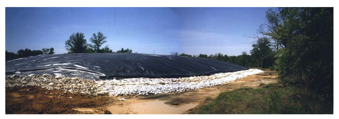
Brass foundry waste staged for removal