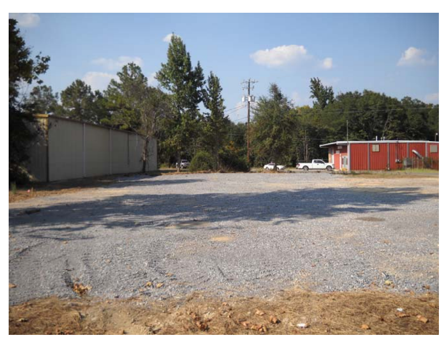
Deep South Plating site, post-cleanup