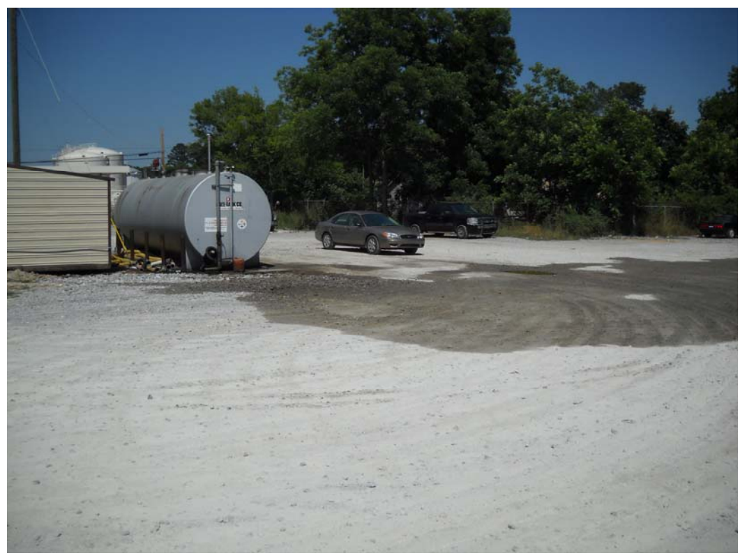
Above-ground diesel tank and leaked fuel

The McCullough Petroleum Spill site is at 255 Hunter Loop Road in Montgomery. Montgomery County, Alabama. In June 2010, ADEM received an anonymous report of a large diesel fuel spill at a local trucking company terminal on Hunter Loop Road. Assessment Section personnel arrived at the site and discovered an area where a high volume of diesel fuel had leaked directly onto the ground and was standing in pools. The spill originated from an above ground storage tank that appeared to have a 7,500 gallon capacity. Although it was unknown how many gallons were spilled, ADEM personnel believed that most of the tank contents had leaked out. The Assessment Section referred the site to the ADEM Groundwater Branch, which issued an incident letter requesting that the responsible party submit a work plan to assess the extent of soil and groundwater contamination. The site operator did not provide an adequate response to the incident letter and the Groundwater Branch issued a Notice of Violation (NOV) to the company. When the company failed to address the issues raised in the NOV, the Groundwater Branch issued an enforcement order to the responsible party to ensure that all contamination will be properly managed or removed from the site. At this time, no further actions are planned under the AHSCF program.