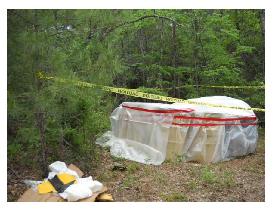
Drums and totes secured and ready for transport off-site