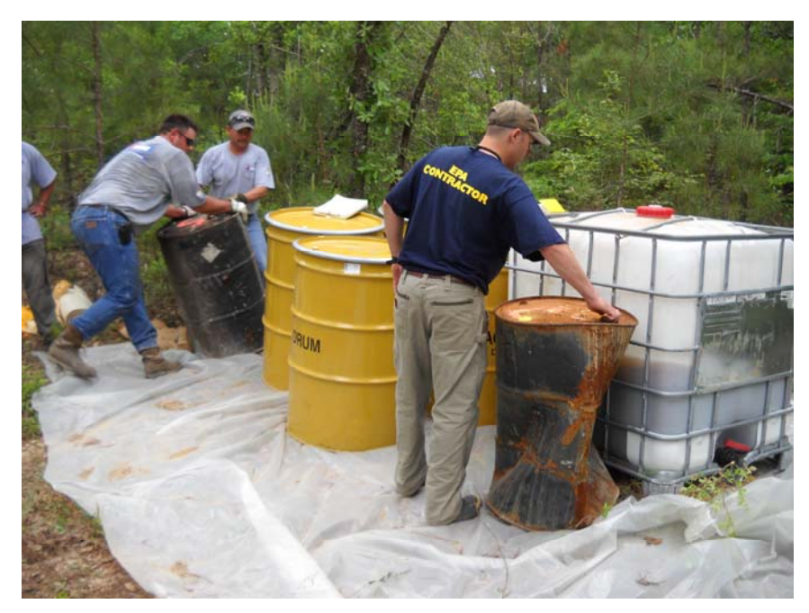
EPA contractors over-packing and staging drums and totes