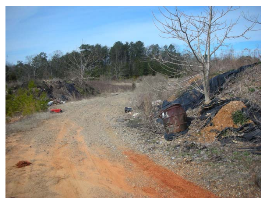
Piles of oil-contaminated soil covered with plastic