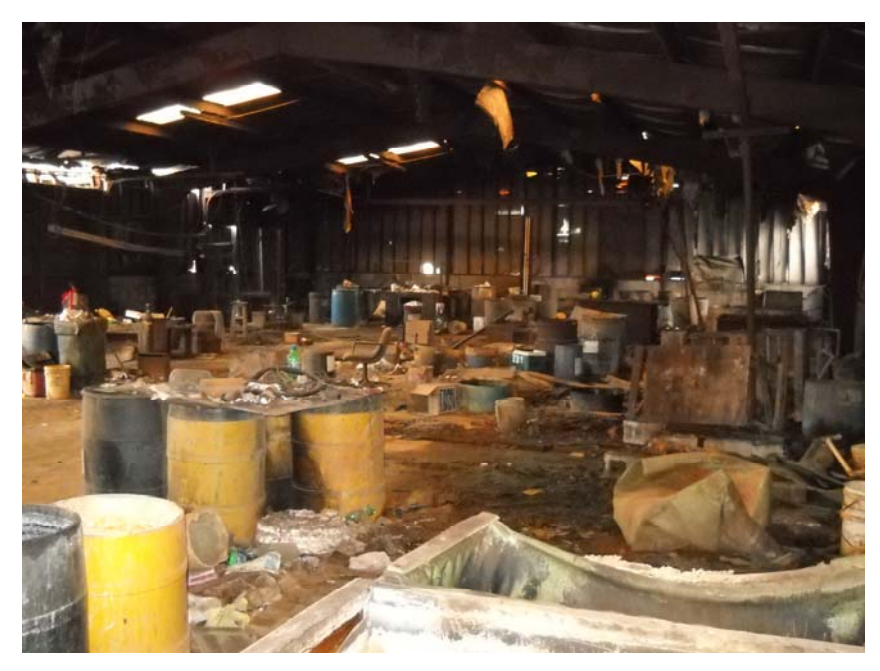
Abandoned drums, plating vats, and debris inside the facility