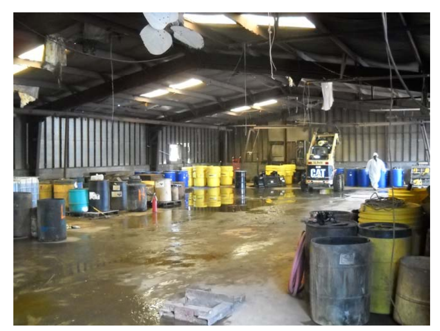
Hazardous materials secured and segregated during EPA response