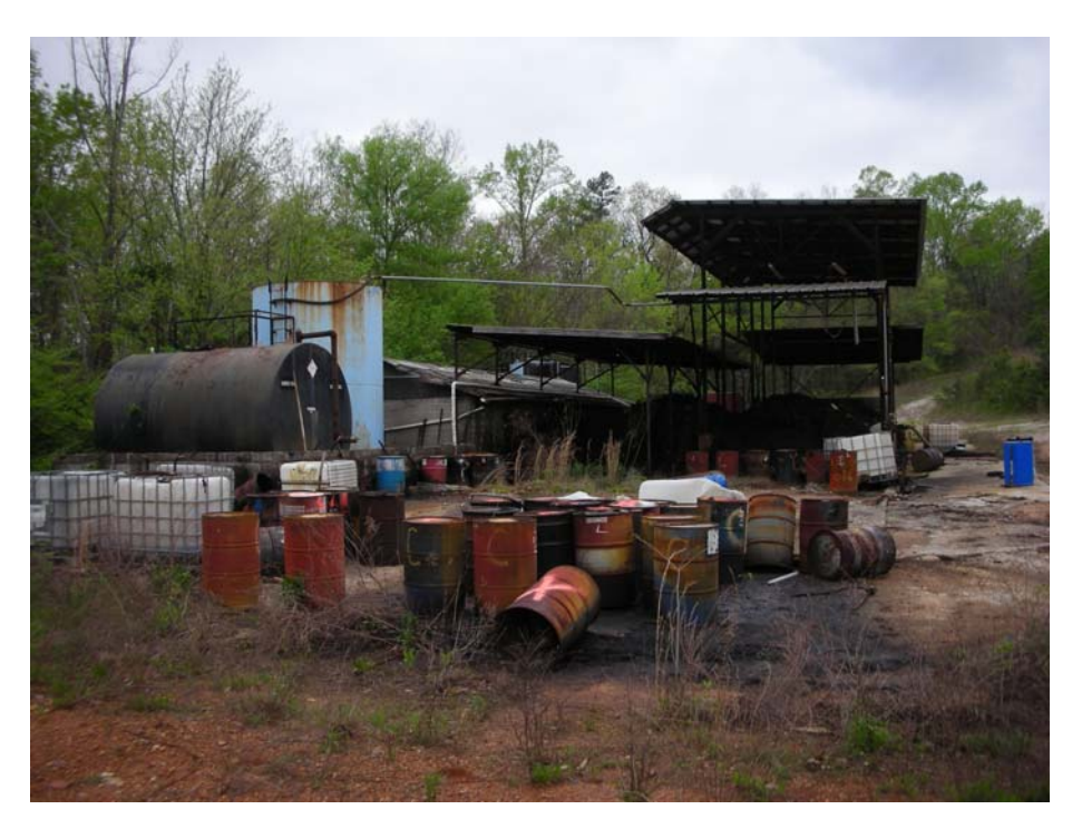
Soil treatment area before cleanup by the responsible party

In June 2009, the property owner entered into the ADEM Voluntary Cleanup Program to address problems at the site. Since then, all drums, oil-stained soils, storage tanks, and other structures have been removed. The environmental contractors have begun assessing the site to determine if contamination exists in the soil or groundwater. The site will remain in the Voluntary Cleanup Program until it can be demonstrated that all environmental issues have been properly addressed. No further AHSCF action is needed for the site.