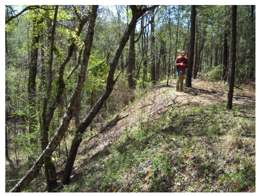
ADEM personnel taking GPS coordinates of an old landfill