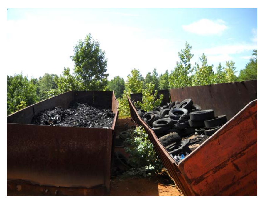
Semi-trailers containing scrap tires and tire fluff