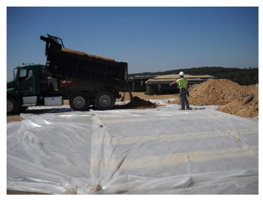
Non-hazardous surface soil removed from right-of-way