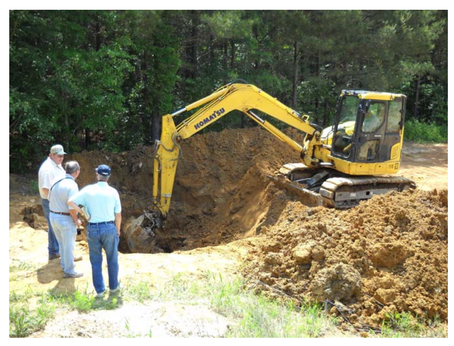
Excavation of burial pit on Cullman Road Department property