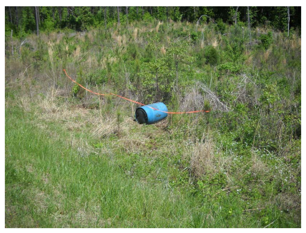
Abandoned drum discovered along County Road 12

ADEM personnel arrived at the site, secured the leaking drum, and transported it to the Coosa County Highway Department storage yard for staging in a secured area. ADEM personnel sampled the drum to assess its contents. The drum was about two-thirds full and contained a dark brown/black liquid. Samples were collected for analysis of Volatile Organic Compounds, Semi-Volatile Organic Compounds, pesticides, herbicides, and metals. Sample analysis indicated that the drum's contents were non-hazardous, and a permit was obtained to dispose of the drum at a municipal solid waste landfill. No further action is expected for this site.