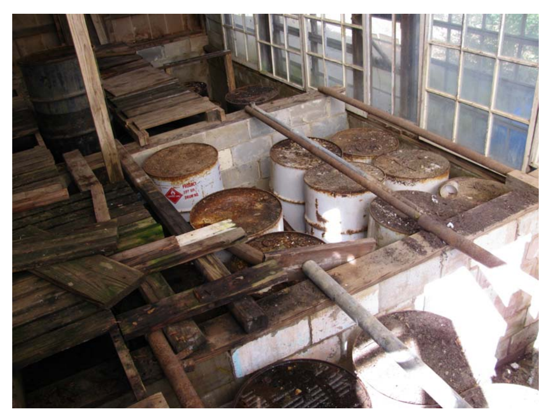
Drums found under flooring in greenhouse

In January 2010, ADEM investigators responded to the site, took photographs, and sampled several drums to assess their contents. Analysis confirmed that they contained water with trace amounts of styrene and ethylbenzene. It was determined that the levels of these constituents were too high to allow for disposal directly onto the ground, and a vacuum truck was contracted to remove the contents of the drums and transport them to a Dothan wastewater treatment plant. About 2,800 gallons of water was pumped from the drums. The owner was responsible for removing the empty drums from the site. No further action is anticipated for this site.