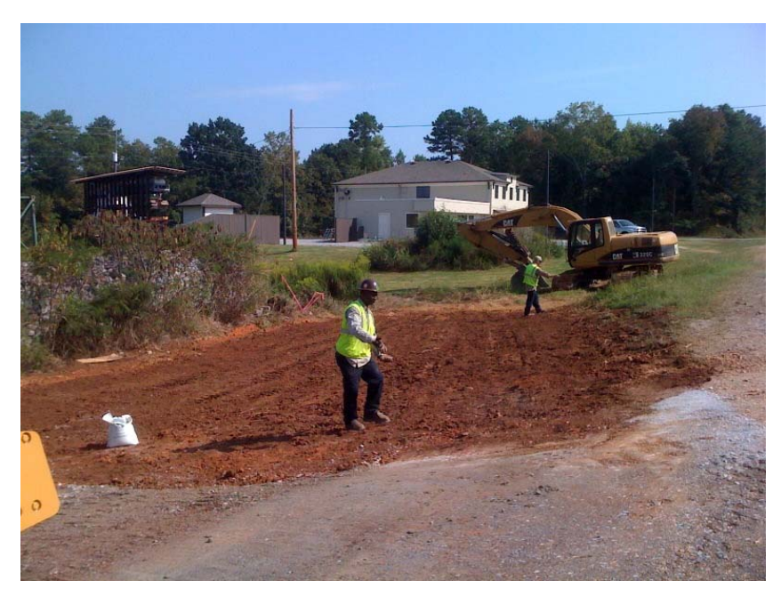
Backfilled excavation area with crew spreading grass seed