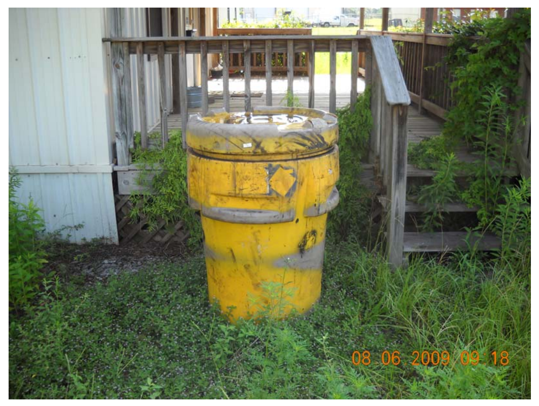
Over-packed drum containing waste paint

The Stagecoach Road Drum site is at 31153 Stagecoach Road in Spanish Fort, Baldwin County, Alabama. In March 2009, Assessment Section personnel were notified by the ADEM Mobile Field Office about several abandoned drums at a business located on Stagecoach Road in Spanish Fort. Assessment Section personnel conducted an investigation at the site and discovered that all but one of the drums had been removed from the site. During interviews with local residents, it was learned that the drums were empty and had been taken by people in the neighborhood. The remaining drum was over-packed and appeared to contain green paint. The owner of the site was contacted and stated he was not responsible for placing the drum on-site. In November 2009, ADEM personnel returned to the site to sample the drum, but it had been removed. The property owner had moved the drum to a secure warehouse nearby and contracted with Safety Kleen to sample and dispose of the drum in question. At this time, the Assessment Section is awaiting transport manifests associated with the sampling and removal of the drum. The Assessment Section currently plans no further actions for this site.