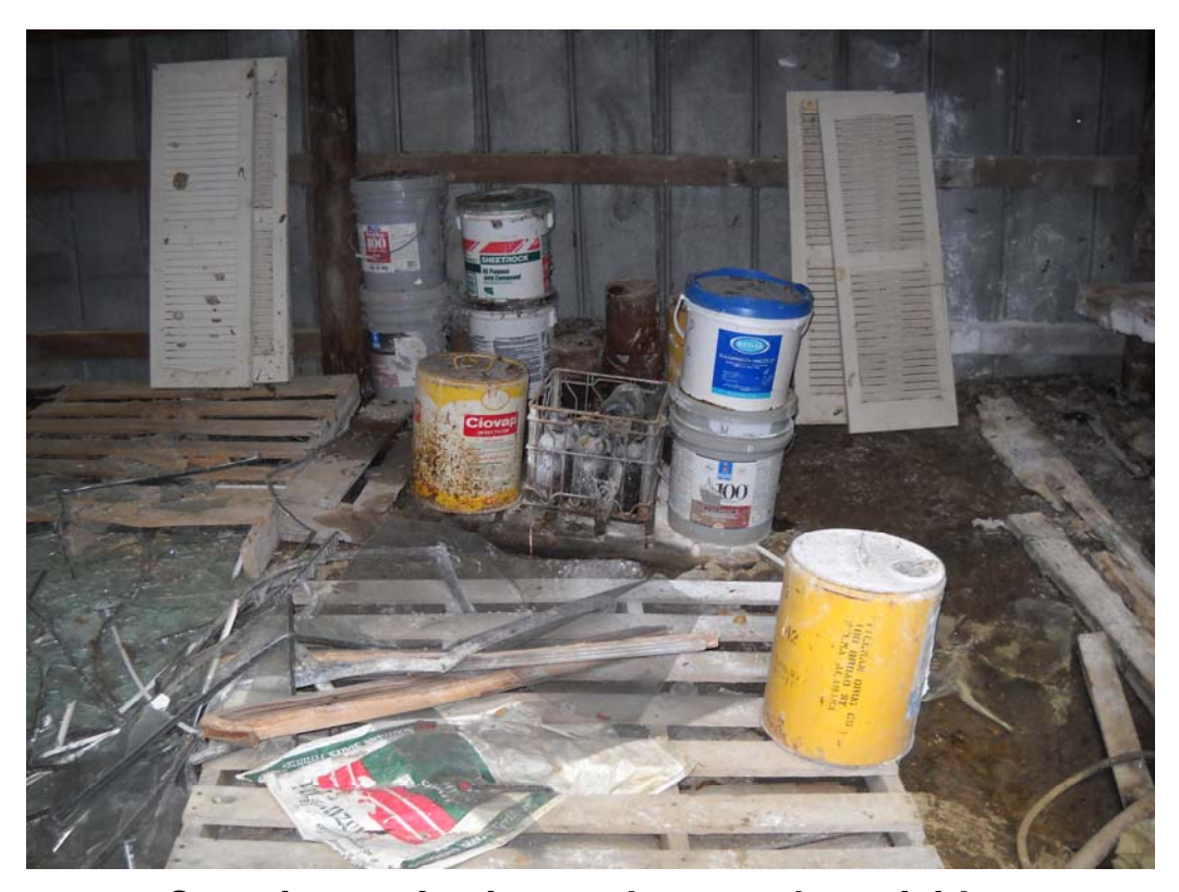
Containers of paint products and pesticides

The Gulf Hauling site is on a rural farm at 10965 County Rd. 21 in Orrville, Dallas County, Alabama. A complaint was received concerning a barn on the property that allegedly contained buckets of arsenic and pesticides. ADEM personnel responded to the complaint and located the barn in question. The dilapidated barn was found to contain several containers of non-hazardous materials such as paint and joint-remover. Additionally, ADEM personnel found a small plastic bucket containing lead arsenate, a commonly used insecticide and rodenticide that was banned for use on food crops in the United States in 1988. Because of the small amount of lead arsenate discovered in the barn, it was determined that the compound was likely being used for its intended purpose as a local rodenticide. Inside the barn, ADEM personnel also found two containers of Rotenone, a fish poison commonly used by biologists to determine fish populations or to control invasive fish species. Rotenone does not persist in the environment for long periods of time, and is only mildly toxic to mammals. It did not appear that these chemicals were being misused or disposed of illegally, and the minimal quantities present in the barn did not represent a threat to human health or the environment. No further action is planned for the Gulf Hauling Site.