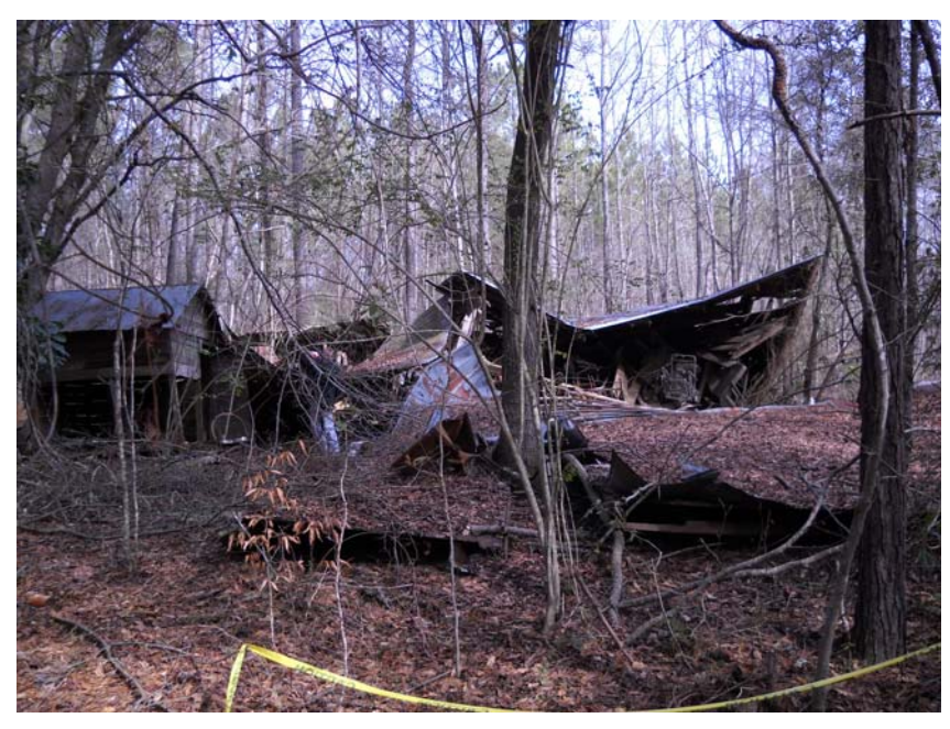
Dilapidated barn where mercury switches were discovered