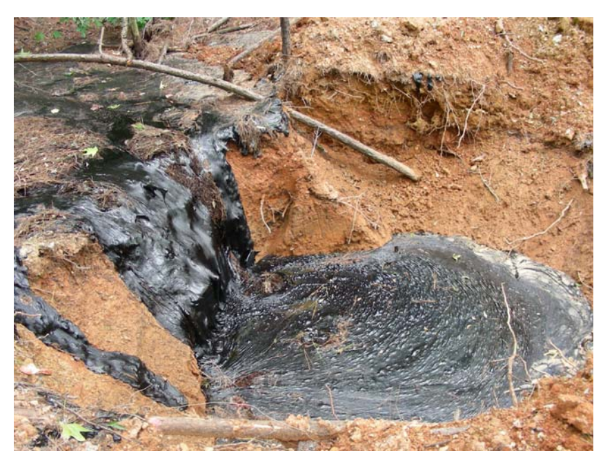
Lagoon runoff collection pit