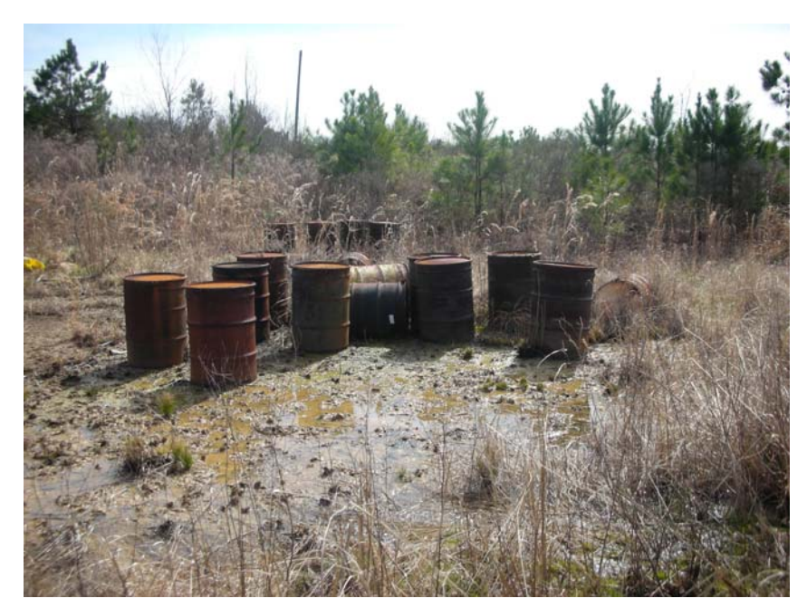
Abandoned drums containing unknown substances