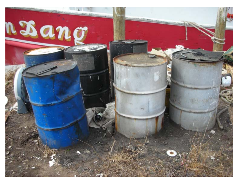
Abandoned drums near fishing dock, prior to removal

During a follow-up visit to the site in April 2009, ADEM investigators discovered that the drums had been moved. The property owner was contacted and he informed ADEM personnel that he had contracted a waste hauler to remove the drums. Assessment Section personnel were unable to find a transport permit for the contractor, who was allegedly engaged in used oil transport/disposal activities. Further inquiries revealed that the contractor had been fined in the State of Florida for illegal transport of used oil in the late 1990's. Since the drums in question were illegally moved off-site by an unlicensed contractor, the site was referred to the Industrial Hazardous Waste Branch for further investigation. There are no further actions planned for the site under the AHSCF program.