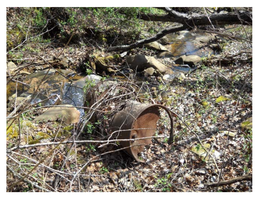
One of several empty, rusted drums on-site