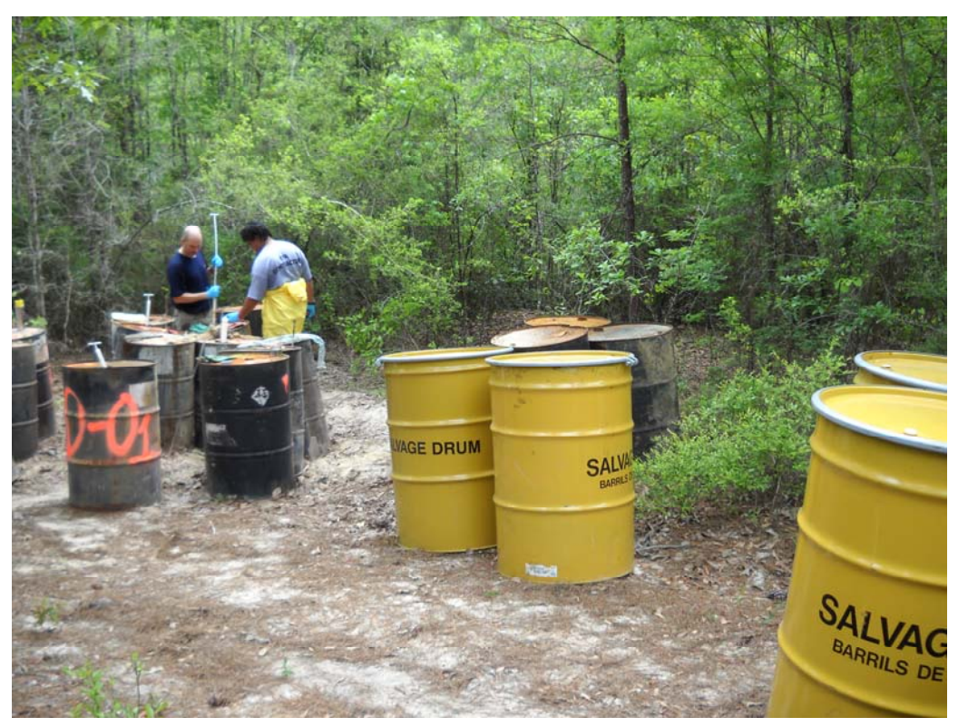
EPA contractors collecting waste samples from drums

ADEM personnel contacted the EPA field office in Mobile, Alabama, and an emergency response was initiated to secure the drums, perform field-testing, collect waste samples, and to relocate the drums to a secure facility until proper disposal of the waste could be coordinated. Liquid wastes were consolidated by EPA contractors into a 250-gallon tote, and drums containing sludge were over-packed in 85-gallon containment drums. The drums and the 250-gallon tote were staged at the local county road department facility until sample analyses were completed. The drums and the tote were then transported to a regulated facility in Arkansas for proper disposal. No further action is necessary for this site.