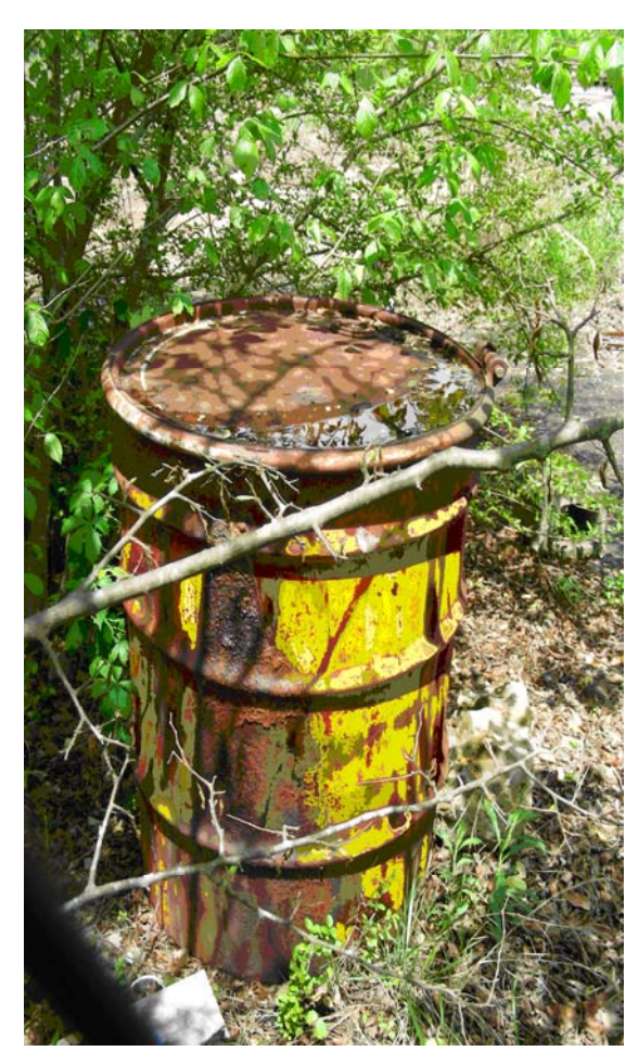
Drum of used oil at Prattville residence

The Simmons Road Drum site is at 203 Simmons Road in Prattville, Autauga County, Alabama. The Assessment Section was contacted by a Prattville resident whose father had recently passed away, leaving behind a 15-gallon drum that contained used oil from lawnmowers and automobiles. Because the resident was disabled and could not move the drum by herself, Assessment Section personnel assisted with the disposal of the drum as a public service gesture. After inspecting the drum's contents, the drum was removed and transported to an automotive service company located in Prattville for recycling the used oil. No further action is necessary at the site.