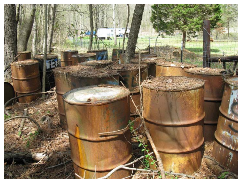
Abandoned drums of paint waste, prior to EPA removal