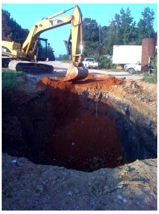
Excavation of the right-of-way along Highway 25