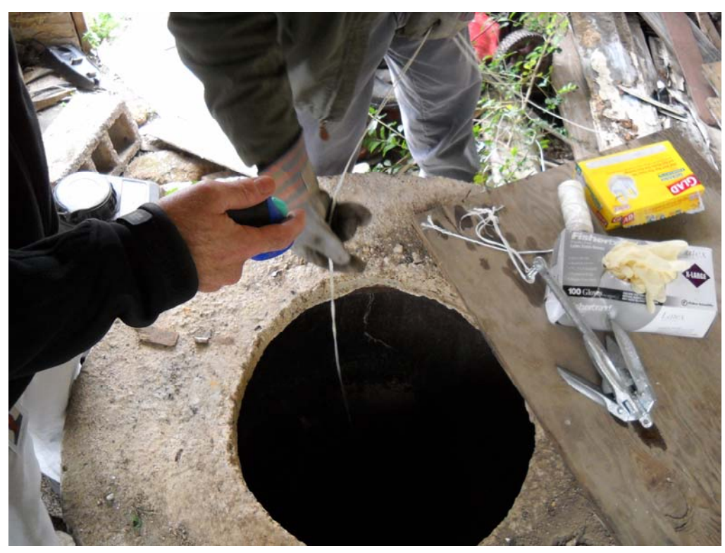
ADEM personnel inspecting and sampling the well

ADEM personnel met with the Shelby County Sherriff's Department to conduct an inspection of the well. Pronged hooks were lowered into the well in an attempt to retrieve any solid materials that may have been discarded. The well did not appear to contain any solid refuse at the time. When an ADEM Field Operations team attempted to collect water samples, they discovered that several used syringes had been discarded in the well. Sample analysis did not reveal any elevated levels of hazardous constituents in the well water. ADEM has contacted the property owner to provide guidance for closing the well to prevent similar incidents. No further action is planned for this site under the AHSCF.