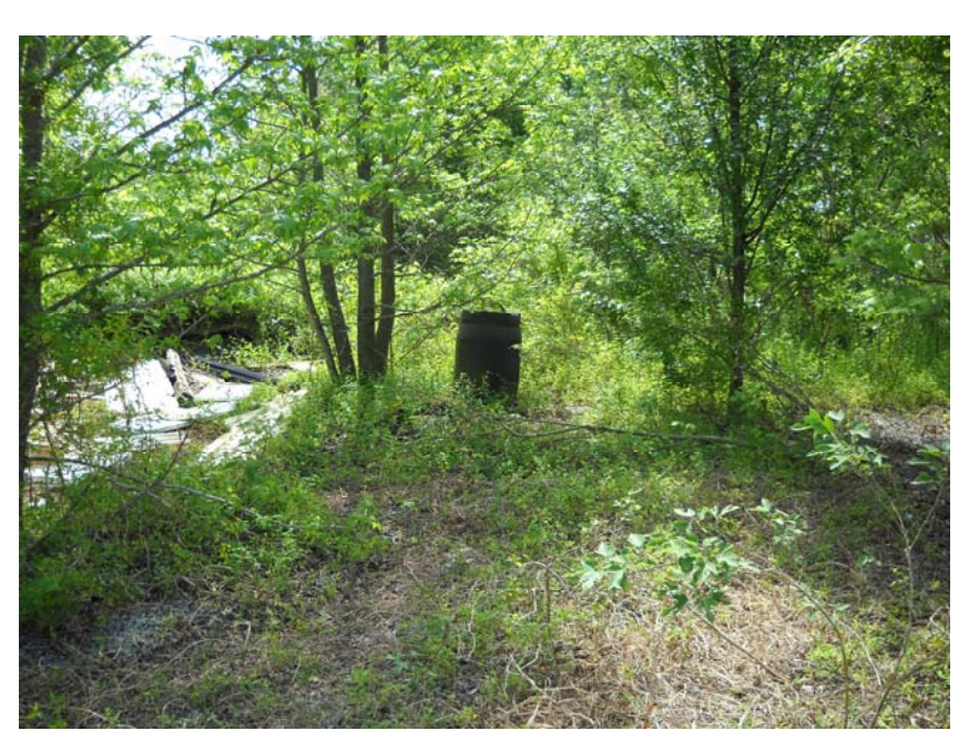
Drums and debris found remaining on-site

After a follow-up visit in July 2010, it was discovered that the property owner had not fully addressed all the solid and hazardous waste issues on-site. The Solid Waste Branch issued a second NOV to the property owner, who requested an extension for cleanup activities. The Assessment Section has been coordinating with the Solid Waste Branch to have the remaining drums and debris removed from the site. At this time, the property owner is in the process of removing all remaining items from the site. The ADEM Land Division will be conducting follow-up inspections to confirm that the site has been adequately remediated.