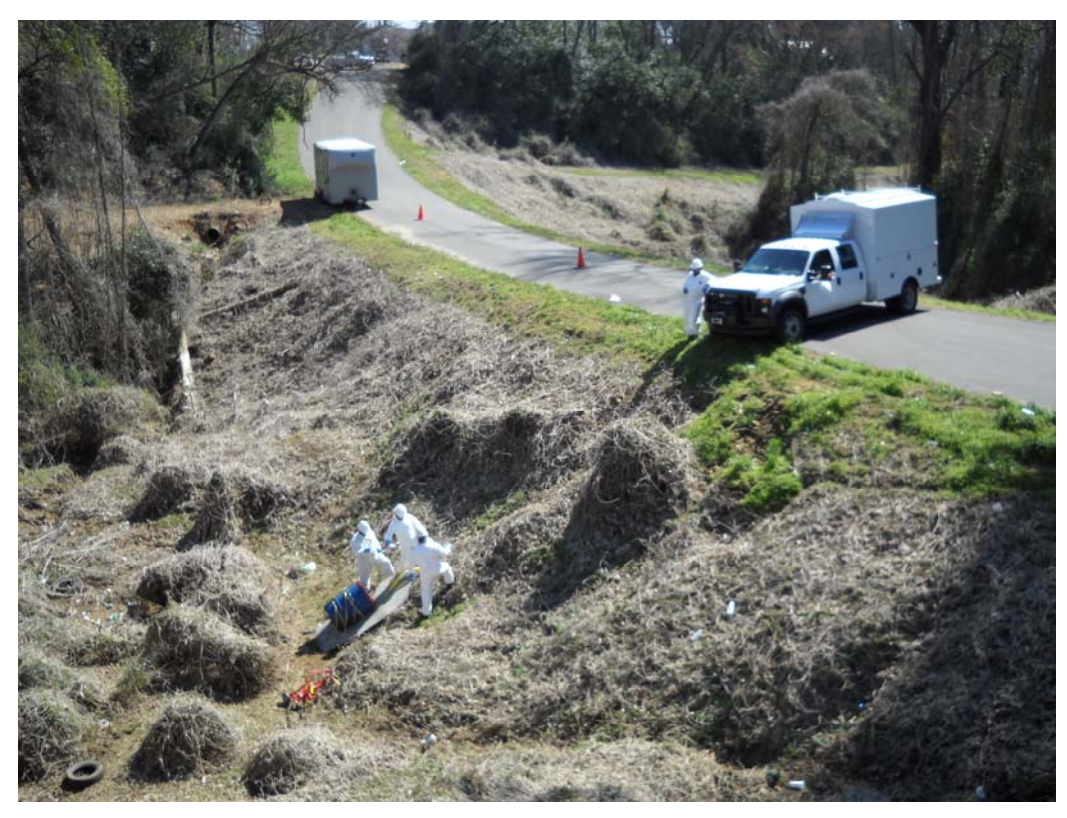
ADEM personnel removing drum from ravine

The Herd Street Drum site is on Herd Street in Tallassee, Elmore County, Alabama. In February 2010, ADEM was notified by local officials that a 55-gallon metal drum had been dumped in a ravine that intersects Herd Street in Tallassee, Alabama. ADEM personnel responded to the site, utilizing a drum lift cradle and power winch to hoist the drum up 30 feet to the road-level. Other containers located in the ravine were old, rusted, and empty. The drum removed was transported to the city shop on Gilmore Avenue where it was staged and sampled. The drum appeared to contain used oil, and sample results confirmed this; however, the material was hazardous due to ignitability. The drum was transported to a fuel blender and disposed of properly. No further action is needed for this site.