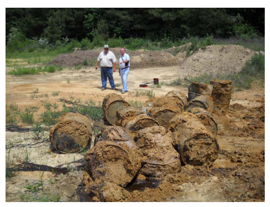
Drums removed from burial pit