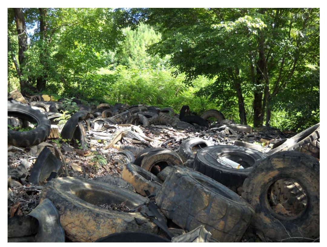
Discarded and buried tires on rural property in Shelby County

The site is a large cleared area along a dirt road littered with multiple piles of electrical cable, tires, and other debris. A large pile of tires about 500 feet long and 60 feet wide was discovered on the property. There was also evidence that tires had been buried at the site. Several old semi-trailers were discovered, two of which contained shredded tires. During the investigation, Assessment Section personnel did not observe any drums, containers, or other evidence of abandoned hazardous substances. The ADEM Solid Waste Branch is working with the property owner to have the tires and other debris removed and disposed of at an appropriate facility. The Assessment Section does not anticipate any further actions at the site under the AHSCF program.