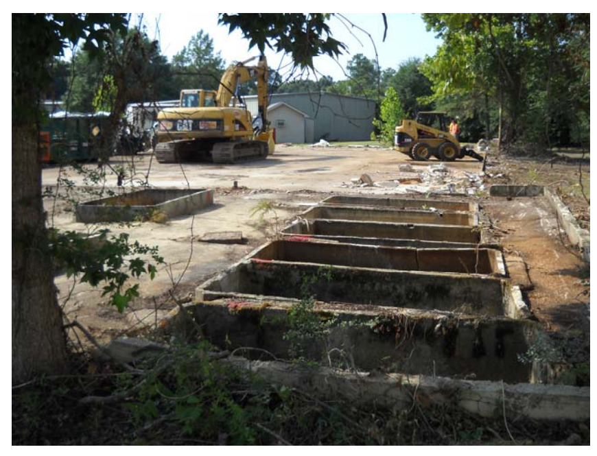
EPA removal of building, concrete pad, and treatment pits