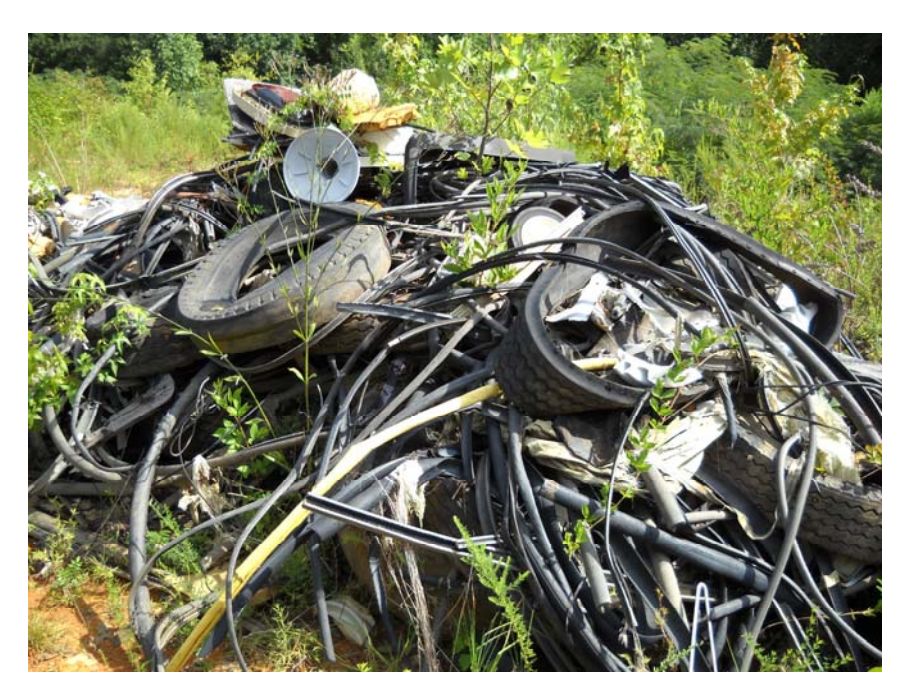
One of several piles of electrical cables and other debris