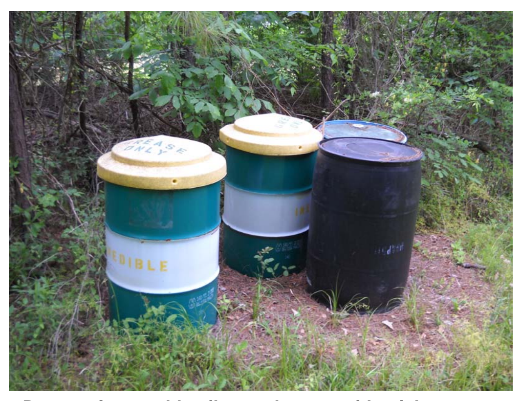
Drums of vegetable oil stored near residential property

The Deer Creek Drums site is at 8786 Vaughn Road in Montgomery, Montgomery County, Alabama. In April 2010, ADEM received a citizen's complaint about abandoned drums of methanol located on a nearby property. Assessment Section personnel responded that same day to investigate the property. ADEM personnel discovered 15 abandoned 55-gallon drums, four chemical totes, numerous 5-gallon buckets, and various other containers on the property. Four of the drums and one of the chemical totes had contents and the rest contained trash or were empty. The owners of the property in question were present at the time, and they revealed that the property was being temporarily utilized to store used vegetable oil for their small bio-diesel business. Despite the labels for methanol on some of the drums, the four drums with contents did contain only vegetable oil. According to the owners, the chemical tote contained used motor oil used as fuel to heat the nearby shop. None of the containers appeared to be leaking at the time of inspection. The owners of the property stated that they were in the process of moving all drums and debris to their business location on Fairview Avenue and that the property would be later sold. Because no evidence of hazardous substances exists on the property, there are no further AHSCF actions planned for this site.