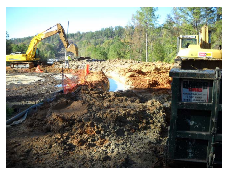
EPA constructing a slurry containment wall around the lagoons