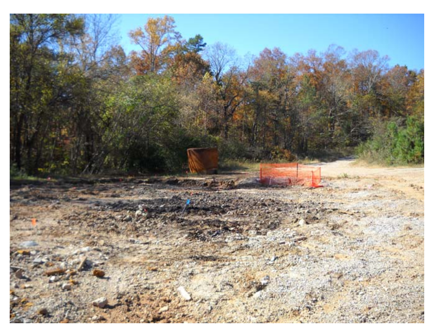
Soil treatment area after cleanup by the responsible party