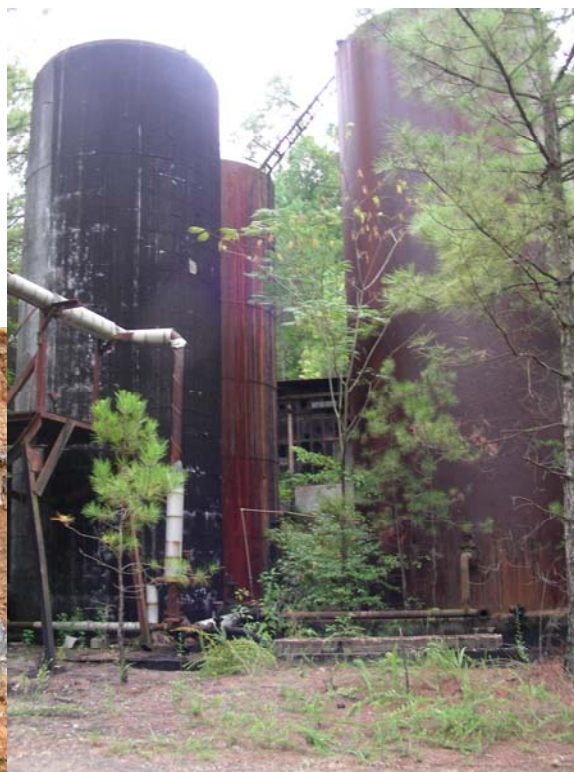
Storage tanks near main building