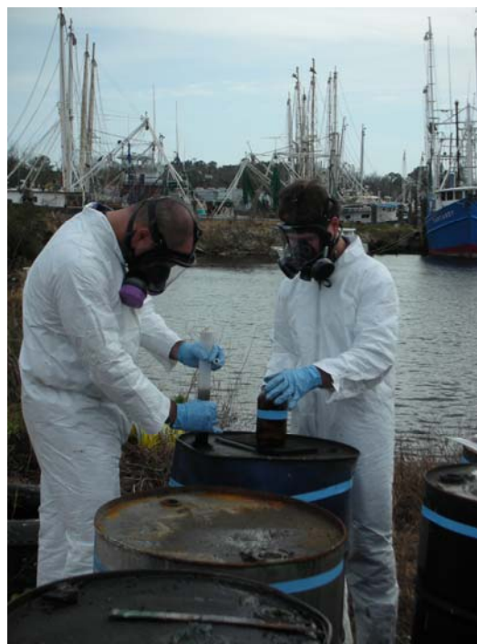
Abandoned drums near Bayou La Batre and ADEM personnel collecting samples