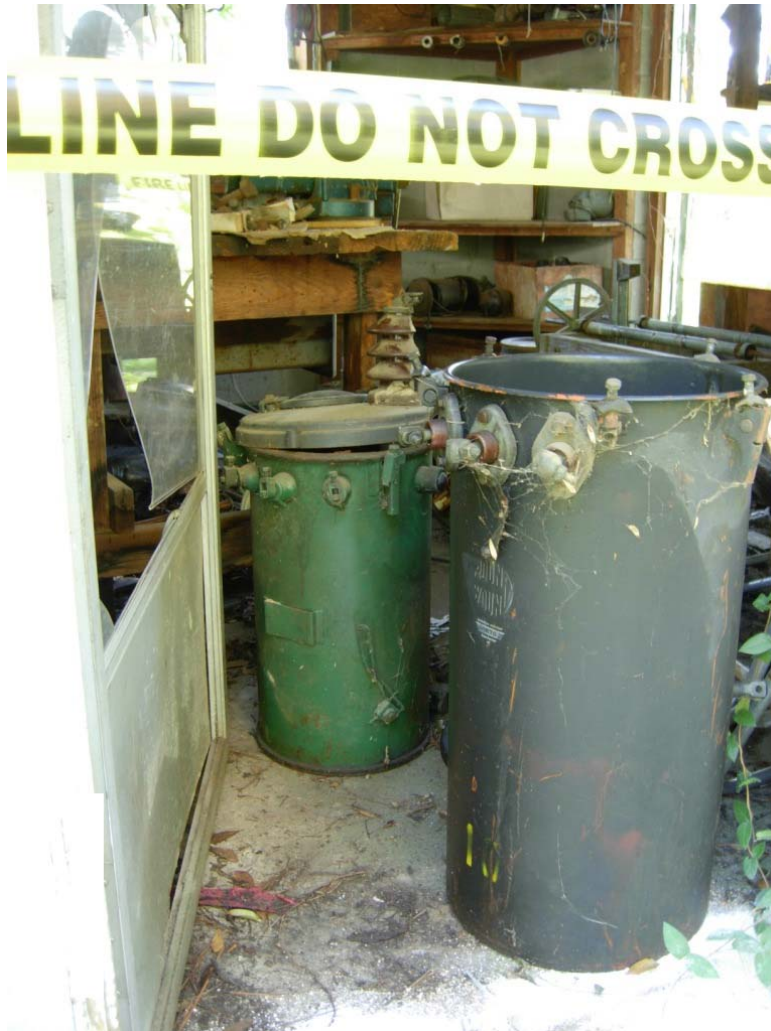
Transformers in residential shed

The Pleasant Grove PCB Site is located at 916 7 th Street, in Pleasant Grove, Jefferson County, Alabama. ADEM received a call from the Jefferson County EMA about a transformer oil spill in a residential area. There were three transformers found in a shed at a private residence on 7 th Street. One of the transformers had fallen over and spilled oil on the concrete floor of the shed. The Jefferson County EMA along with Alabama Power representatives determined that the transformers likely contained PCB oil, and that ADEM involvement was required. ADEM investigators arrived at the site and found three transformers and one capacitor inside the shed; the capacitor was labeled as non-PCB. Oil samples were collected from all three transformers and sent to the ADEM Central Laboratory to test for the presence of PCB's. Sample analysis revealed that all three transformers did not contain PCB's. No further action for this site is planned under AHSCF at this time.