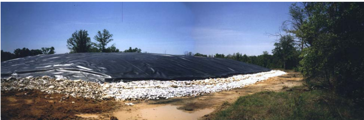
Staged brass foundry waste awaiting removal