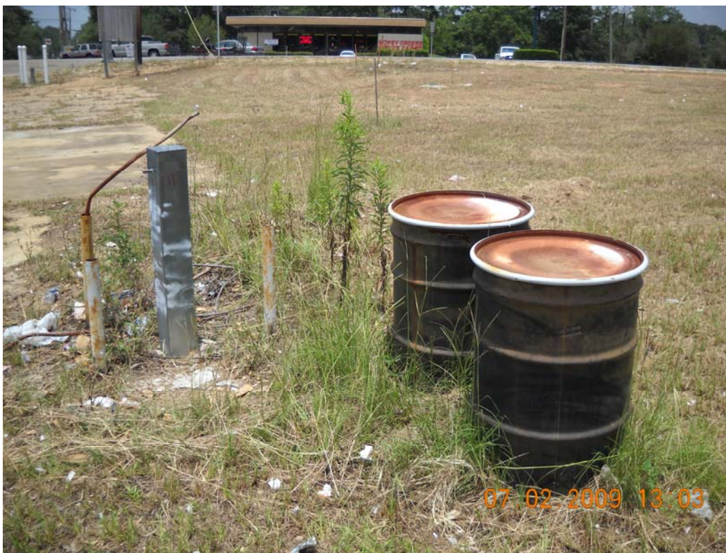
Monitoring well and purge-water drums

The Padgett Chevron Drum Site is located at the corner of Cherokee Avenue and Montgomery Highway in Dothan, Houston County, Alabama. While conducting an unrelated site visit, an ADEM employee was notified about two abandoned drums that had been staged in an empty lot for several years. ADEM personnel located the site and found two unlabeled 55-gallon drums in an empty lot adjacent to a residential area. The drums were staged next to a groundwater monitoring well, which led inspectors to the conclusion that the drums in question most likely contained purge water from the wells on-site. Further investigation revealed that the site was previously a gas station (Padgett Chevron) where an underground storage tank (UST) leak had occurred. Groundwater monitoring had been taking place at the site and the drums contained non-hazardous purge water. ADEM's Groundwater Branch was notified about the situation and the company responsible for sampling the wells will be contacted to remove the drums. No further action under AHSCF is planned for this site.