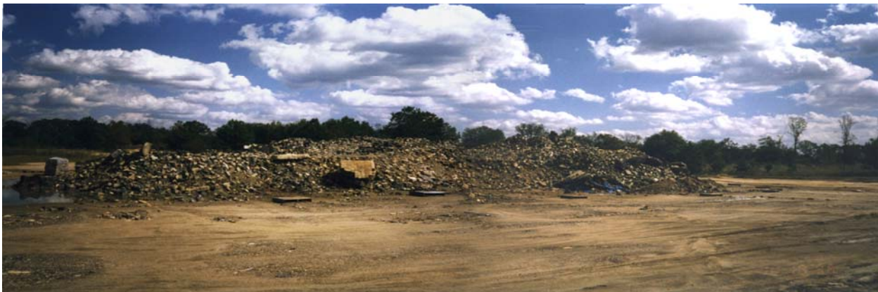
Foundry brick staged for removal

Beginning in 2009 and annually thereafter through 2013, EPA will invoice ADEM for $100,000 per year. In 2014, EPA will invoice ADEM for the remaining portion of the 10% cost, not to exceed $132,879. ADEM will pay the State share of the project cost through the Alabama Hazardous Substance Cleanup Fund.