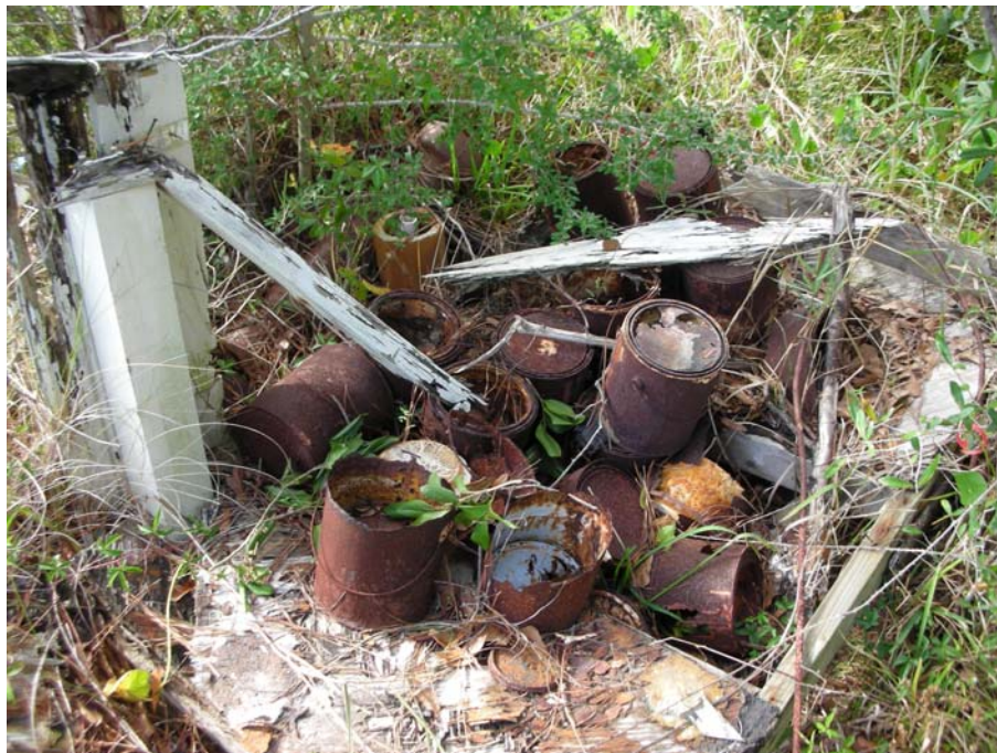
Deteriorated paint cans near south side of property

In conclusion, because the building has been razed and the land cleared, and the preliminary XRF testing revealed little or no lead on the property, no further action under AHSCF is planned for this site unless more evidence becomes available to warrant further investigation.