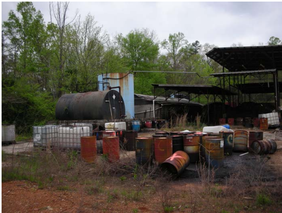
Drums and storage tanks, with cinder-block building in background

At this time, the owner of the property is coordinating with ADEM's Voluntary Cleanup Program to sample and remediate areas of concern at the Site. Currently, all drums have been removed as well as major areas of soil contamination. Further sampling will be conducted in order to determine the full extent of soil contamination.