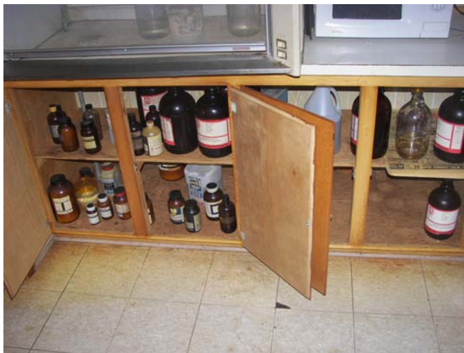
Containers of chemicals inside the Magnolia St. residence

Local EMA officials and ADEM performed hazardous waste determinations on the abandoned chemicals. The aggregate total of potential characteristic and listed hazardous wastes was determined to be less than two hundred and twenty pounds. On March 26, 2009, the Town of Loxley hired a contractor to remove chemicals from the residence. Some chemicals were able to be reused as commercial chemical products; all other chemicals were disposed as hazardous waste at an approved hazardous waste disposal facility. At this time, no further action under AHSCF is anticipated for this site.