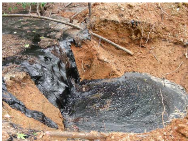
Black substance in collection pit

EPA has scheduled an emergency cleanup of the site in late 2009/early 2010, weather permitting. At this time, ADEM is coordinating with EPA regarding all cleanup activities and future actions at the site.