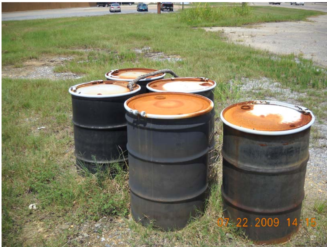
Purge-water drums near Highway 231

The Wetumpka Highway 231 Drum Site is located in Wetumpka, Elmore County, Alabama. ADEM personnel were sent to investigate a complaint about several abandoned drums in an empty lot near Highway 231 in Wetumpka, Alabama. There were a total of five 55-gallon metal drums staged in the empty lot. During inspection of the drums, ADEM personnel were engaged by the property owner who explained that the drums contained purge water from groundwater monitoring wells on-site. According to the property owner, the lot was previously a gas station where an underground storage tank (UST) leak had occurred. Monitoring wells were established to determine the extent of groundwater contamination on-site, and the drums contained the purge water pumped from those wells. At this time, ADEM is having the environmental contractor that sampled the wells return to the site to remove the drums in question. No further action under AHSCF is planned for this site.