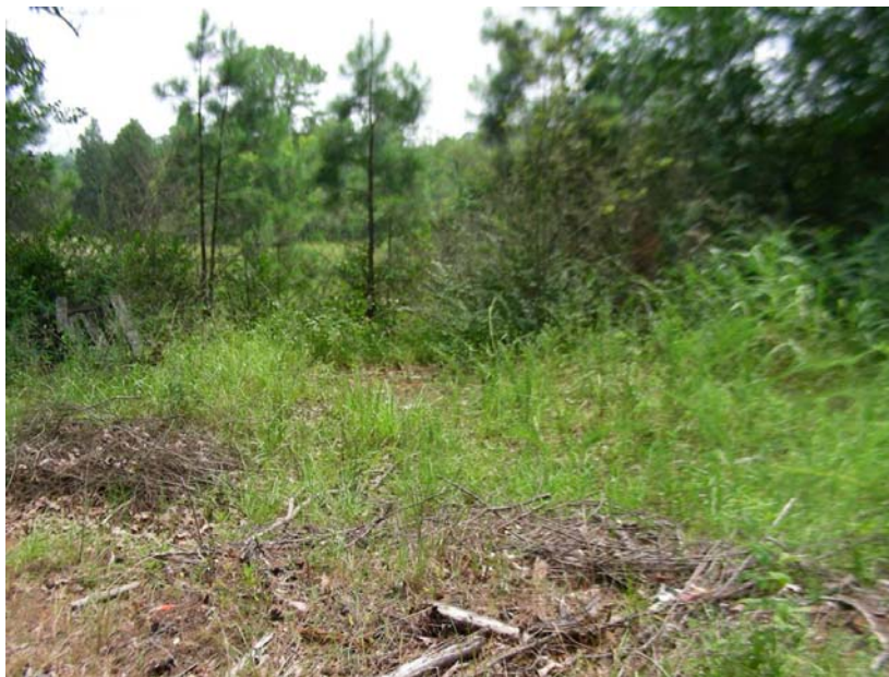
Area where White's Chapel drums were formerly located

In 2008 a follow-up visit was completed with assistance from the EPA Emergency Response and Removal Branch. The visit was to further assess the condition of the drums, but, upon arrival, it was found that the owner had removed the drums from the site. The drums had been removed during a three-week period between the last visit by the local EMA and the subsequent follow-up visit conducted by ADEM and EPA. With assistance from the local EMA, it was learned that Mr. Bickers had consolidated all paint wastes into one drum, poured rainwater from the remaining drums and removed all drums to his property. The empty drums were crushed and sent to a metal recycler. Analysis of the paint waste in the one drum remaining is still pending and is being paid for by the owner. Once analytical results have been received, a determination will be made for the appropriate disposal of the remaining drum of waste.