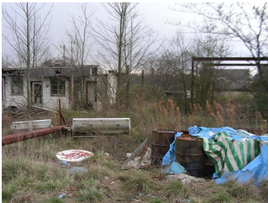
Drums and debris near Highway 278

The ADEM Solid Waste Branch has issued the site owner a Notice of Violation for the unauthorized storage of construction and demolition wastes. The owner has also been advised to retain the services of an environmental contractor that will sample and remove the drums for proper disposal. The property owner responded to ADEM and requested 180 days to complete cleanup activities at the site. ADEM approved this request, stipulating that the owner must provide the Department with copies of transport manifests and other relevant documents.