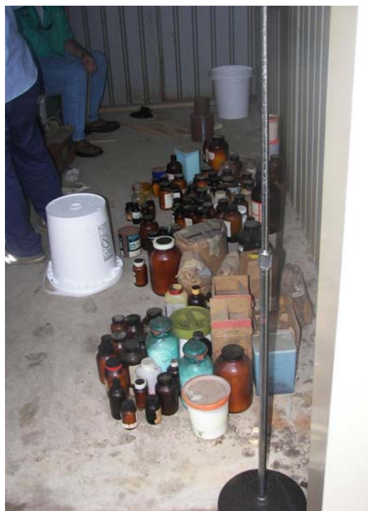
Abandoned chemicals being prepared for removal from the U-Stor-It unit