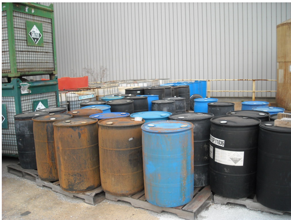
Drums and totes staged for transport

ADEM contacted the owner of the site regarding these issues who explained that all hazardous waste on-site was being prepared for transport to sister facilities. Since there is an owner of the site, the site was referred to ADEM’s Industrial Hazardous Waste Branch for further RCRA action. The Compliance and Enforcement Section conducted a site inspection and confirmed that all hazardous materials had been properly removed. At this time, no further action under AHSCF is planned for this site.