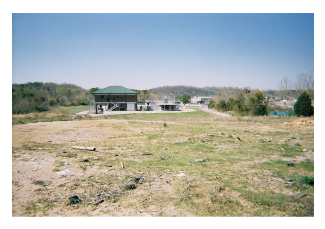
The site, Pelham WWTP burn/dump site, Shelby County

The Pelham Waste Water Treatment Plant site is located near Old Tuscaloosa Road off of Lee Street, in the City of Pelham, Shelby County, Alabama. Following the receipt of a citizen's complaint, the U.S. EPA Region 4 Superfund program requested ADEM assistance and involvement in responding to the complaint. The complaint arose when the City of Pelham began utilizing the area to burn storm debris following Hurricane Ivan. In addition to the burning by the City, unauthorized/illegal dumping of household garbage and bagged grass clippings was also occurring at the site by local residents. The initial site visit and meeting was conducted under the AHSCF by Environmental Services Branch personnel. Due to the additional assessment activities that were requested by EPA, the site transitioned from the AHSCF program to the federal Superfund Program to be assessed as a Pre-CERCLIS Screening Assessment in order to evaluate and document the response efforts and site conditions. Those assessment activities are currently underway.