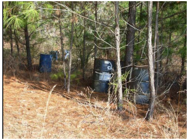
Etowah County Humane Society Drums, Gadsden, Alabama

clear the property, they discovered 7 abandoned, 55-gallon drums of unknown materials. They reported the drums to ADEM and investigators responded to the site, obtained samples from each drum, ensured the integrity of the drums, and took the samples to the ADEM Laboratory in Montgomery for analysis. Analysis of the samples indicated the materials were mixtures of waste oils, hydraulic fluids, and gasoline. These drums were staged on-site and as of October 1, 2006, they were awaiting transportation and proper disposal at a fuel blending operation at this time.