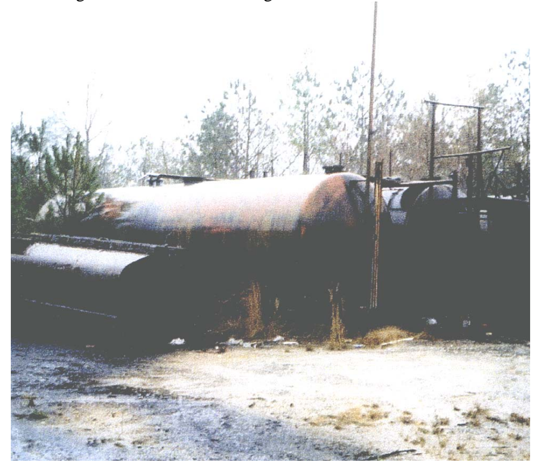
Tanks at Performance Advantage

Investigators responded to the site and met with US EPA personnel. It was also observed at that time that oil that had soaked into the ground was seeping to the surface due to recent rain storms. Clean up activities performed by EPA contractors included pumping oil from the leaking tanks into one of the larger tanks.