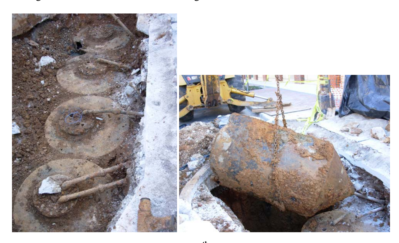
Removal of Tanks From 19<sup>th</sup> Street, Birmingham, Alabama

This site is an underground storage tank site discovered by City of Birmingham workers during maintenance on water mains along 19^{th} Street between 4^{th} and 5^{th}