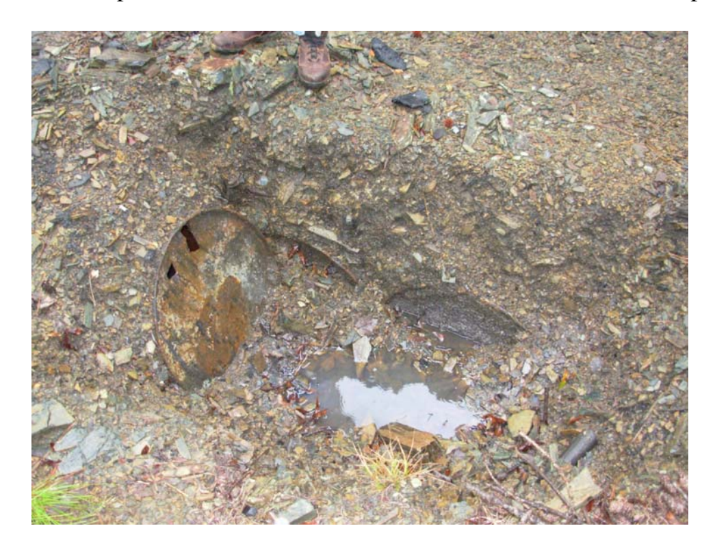
Buried drums located on Turner Property

The Turner property is located in Cleburne County along County Road 107. ADEM investigators received an anonymous complaint of possible buried drums at this site. ADEM personnel responded to the site and discovered a burn area where the previous