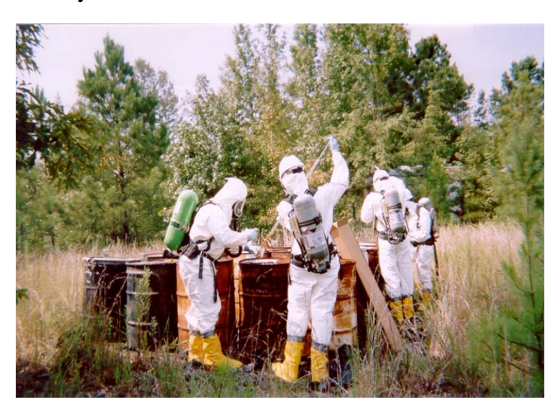
HAZ Mat Team Sampling Drums, McCullough Oil, Chilton County

The McCullough Oil Recycler site is located at 145 County Road 523, in Chilton County, approximately 4.5 miles ease of Verbena, Alabama. The owner and