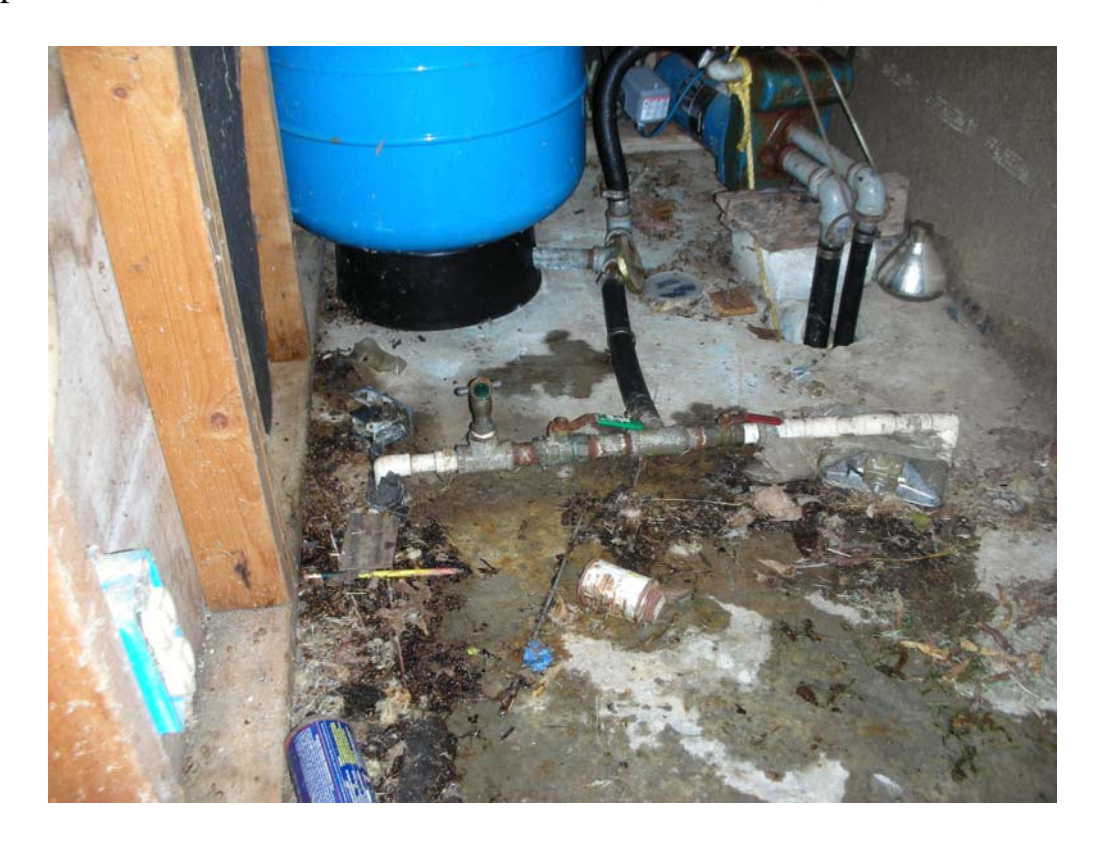
Well at Hollywood Meth Lab Site

This site is located at a residence on County Road 42 in Hollywood, Jackson County, Alabama. The Jackson County Sheriff's department busted a suspected methamphetamine lab at the residence. At the time of the bust, individuals involved