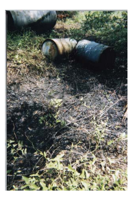
Drums, Nets, and Dipping Vats at Bayou La Batre