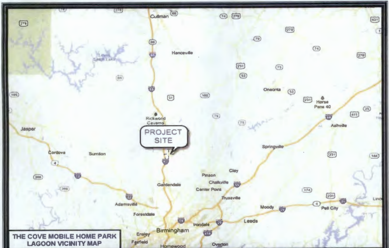
THE COVE MOBILE HOME PARK LAGOON VICINITY MAP